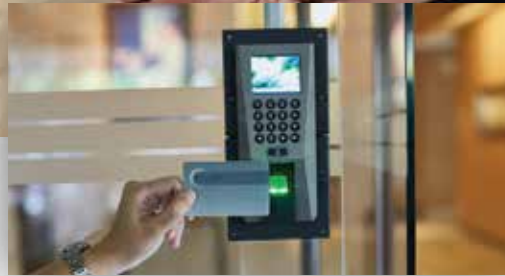
Lobby Access Control System