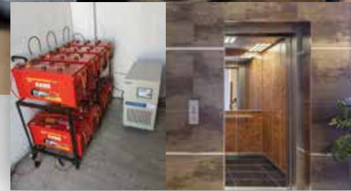
Lift With Battery Backup